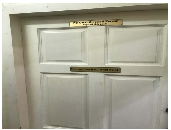
Fig. 1 –Entrance to MISU (photographed April 2019)

22. There was a restrictive sign on the door to the Management Information System Unit (MISU), as shown in Figure 1 below. During the audit, we observed that unauthorized persons were not allowed to enter the department, except in one instance where approval was granted to an officer who was allowed entry to clear an issue with one of the database staff.